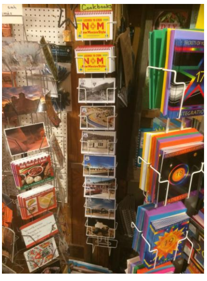
Our EMHS postcards at Tinkertown.

After printing costs, our treasury has dipped from an all-time high of more than $4,000 (thanks to the grant, four years of calendar sales, plus our catalog of four booklets). Our bank